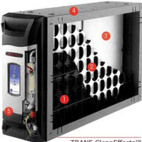
TRANE CleanEffects™ whole house air filtration system